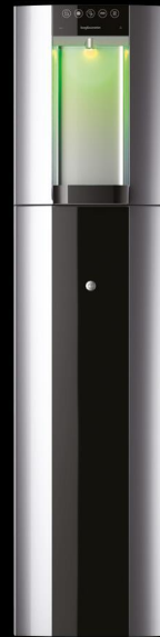
Silver - Floorstanding