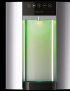
Silver - Countertop