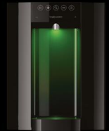
Black - Countertop