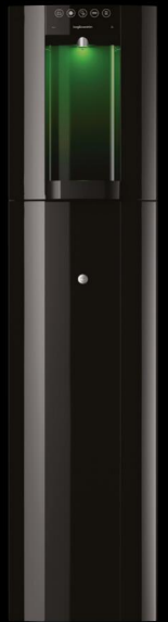
Black - Floorstanding