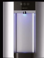
Silver - Countertop

Installation Kit with 3M Filter Contains 3M carbon filter and parts required for easy installation.