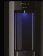
Black - Countertop