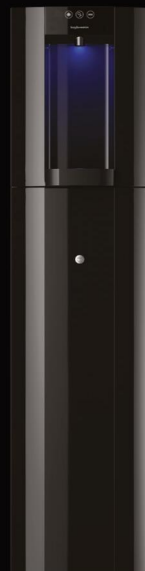
Black - Floorstanding