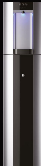
Silver - Floorstanding