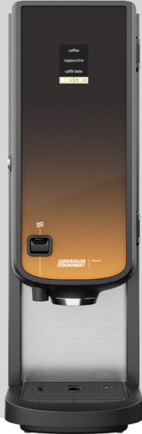
DCS-2 with hot water tap