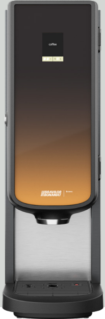
DCS-1 without hot water tap