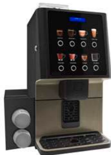
Cup module kit For dispensing cups.