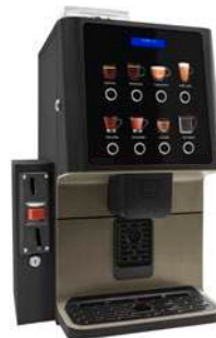
Validator module kit Ready to install a coin validator.