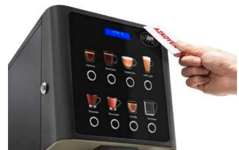
RFID Reader Kit For product recharge card or cashless systems