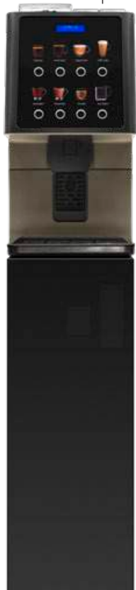
Base cabinet kit Ready to install a coin validator. (850 mm.)