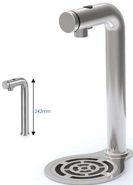
DW3 EcoBoiler 3 Litre Boiler