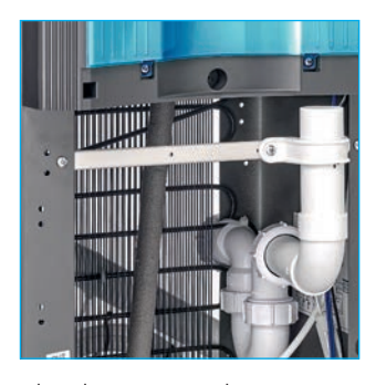
The drip tray can be connected to mains drainage.