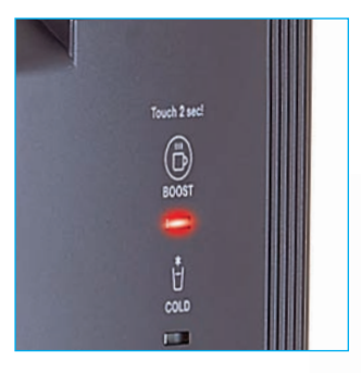
Hot water booster button to raise the temperature from 92°C to 95/96°C. Good for tea!