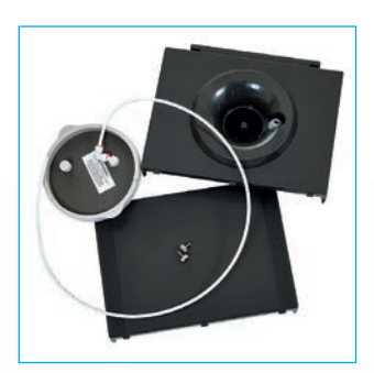
Easily convertible from bottled to POU. The bottle top includes Spil Guard leak protection.