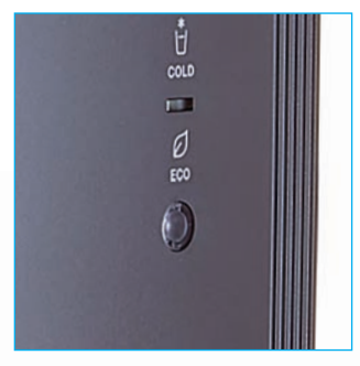
ECO sensor turns the boiler off when the office lights are switched off. Saves up to 25% in electricity!