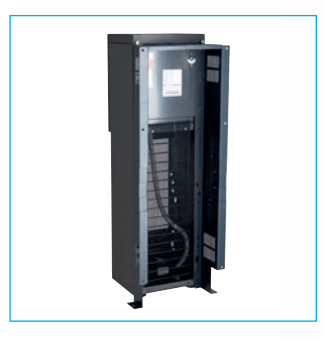
Cowling to fix the cooler securely to the wall – supplied separately.