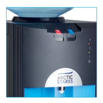
Modern, reliable, manual push down taps. Tamper and break resistant. Hot tap with safety lock.