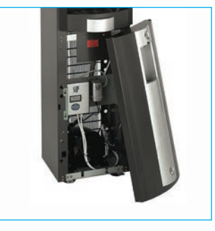
SIP Automatic 24/7 ozone sanitising with sleep mode. Reduces sanitising callouts by 50% and energy consumption by 40% – factory installed.